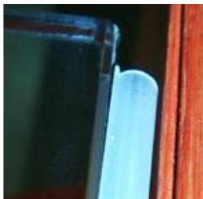
Application example 1