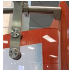
Photo of the extrusion bonded onto the edge of the Novaglas presentation cabinet